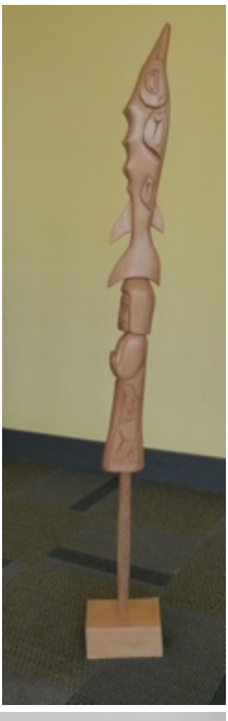
The talking stick