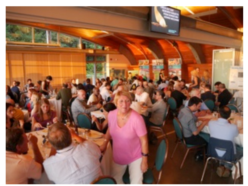
Deep Bay dinner event event