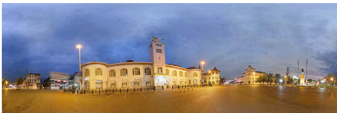
Shahrdari Square of Rasht city

The steering committee and sponsors of the ICSA2016 look forward to welcoming you to Iran in September 2016. We are assured that your participation will help to make this event a great success.